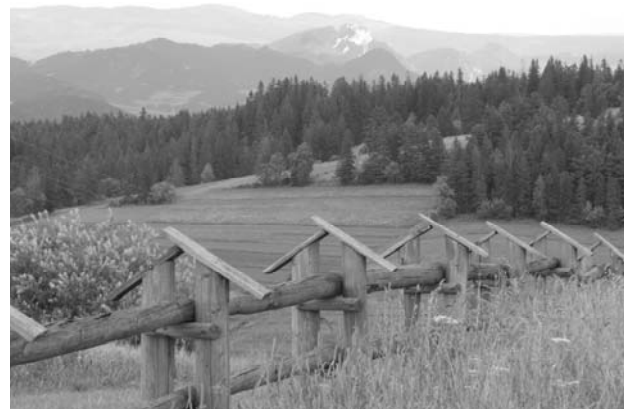
Fig. 1. Panorama from Litwinka Mountain.

The area of Czarna Góra village, due to its characteristic location on the border of Jaworzyńska Valley and the Spisko-Gubałowskie Foothills and in the valley of River Białka Tatrzańska, possesses high scenic values. Among the factors influencing the scenic attractiveness are large eleva-